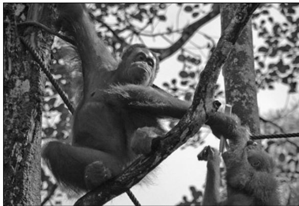
The famous orangutans of Borneo enjoy performing for visitors.

For more information on Malaysian Borneo, including a list of tour operators, contact the Vancouver office of the Malaysia Tourism Promotion Board at 604-689-8899.