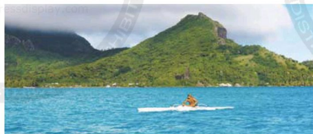
Local paddlers in traditional races often raced alongside our catamaran.