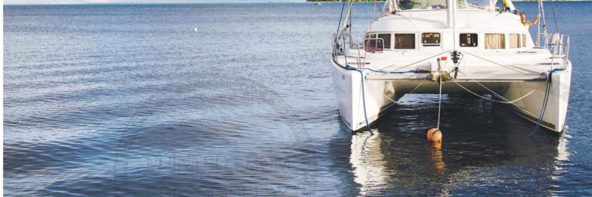
Each evening, our private catamaran dropped anchor in the tranquil waters of one of French Polynesia's lagoons.