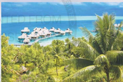
Sheltered turquoise lagoons surrounding lush, mountainous islands make French Polynesia a tropical dream destination.