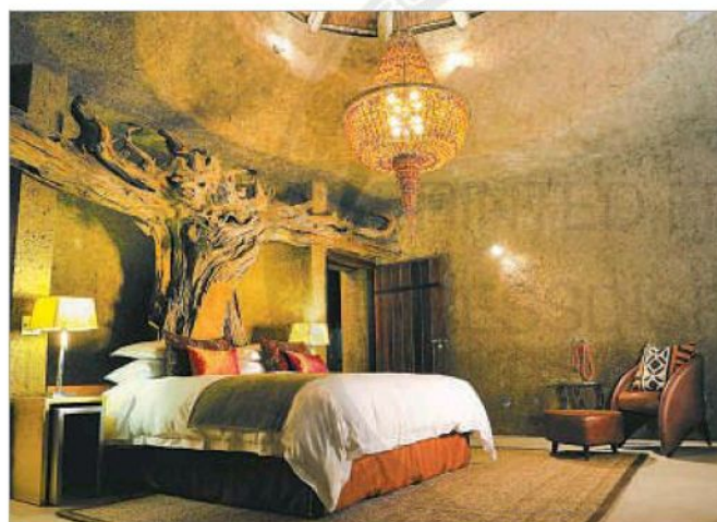
Sabi Sabi Private Game Reserve