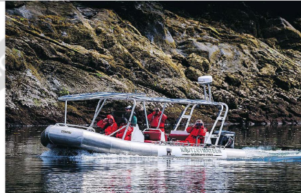
Khutzeymateen Wilderness Lodge is one of many tour operators in the Great Bear Rainforest.