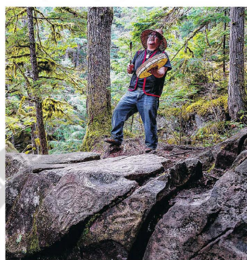
Above, the Nuxalk Nation has their homeland and territory in and around Bella Coola. Left, a bear spotted from a boat tour. Below, bald eagles and other wildlife are popular in the Great Bear Rainforest.