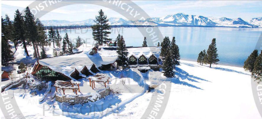
The Lodge at Edgewood Tahoe occupies 95 hectares of pristine lakefront straddling the California-Nevada state line.