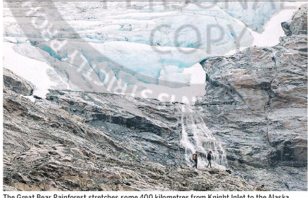
The Great Bear Rainforest stretches some 400 kilometres from Knight Inlet to the Alaska Panhandle.

VANCOUVER SUN SATURDAY, MARCH 23, 2019 SECTION 6