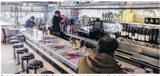
Truckee's popular eatery, Jax At The Tracks, serves American classics in an old-school diner setting.

With the roads finally open, I set out to explore the nearby ski-bum town of Truckee. A logging and railroad crossroads in the 19th century, Truckee retains an Old West vibe, especially along its carefully restored main street, lined with historical sites, galleries, cafés and boutiques.