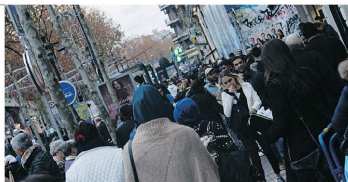
Marseille hopes to refurbish its image by planting more trees and turning streets over to pedestrians.

A deeply offensive slur, or a childish but savvy marketing gimmick? That's the debate raging in Australia after the unveiling