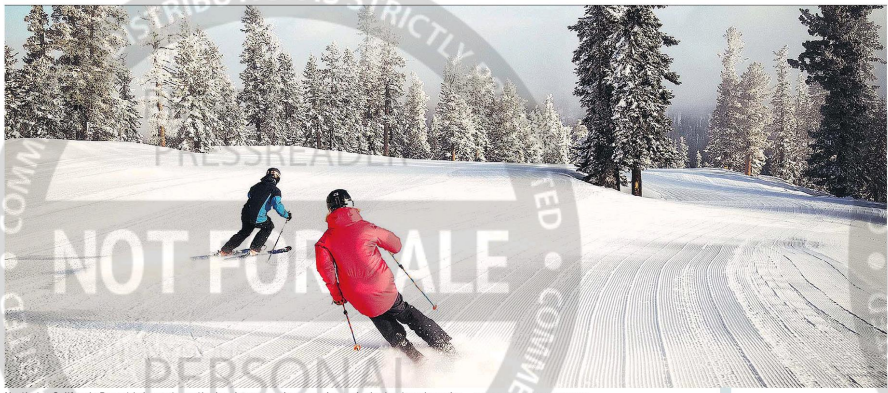
Northstar California Resort is home to meticulously groomed runs and award-winning terrain parks.