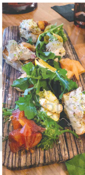
Enjoy a meal at the acclaimed Wolf in the Fog restaurant.

Zed Hotel guests can hang out in the poker room, hit the mini disco or arcade, and ride guest bicycles right through the lobby. And even get your fortune read by a resident psychic just in case you're wondering how your surfing lesson will