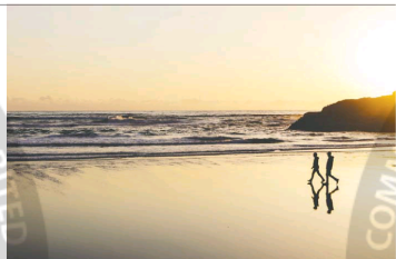
Tofino's vast beach areas are known for their beauty and size. At left, Pacific Rim National Park Reserve is famous for its gigantic Western red cedar and Western hemlocks.