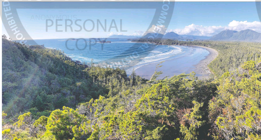
Tofino's Cox Bay Beach hosts international pro surfing competitions each fall, offering visitors front row seats amid the beauty.