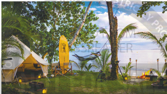
Guests can camp out at Nanuku Resort in Fiji, which offers an array of activities.