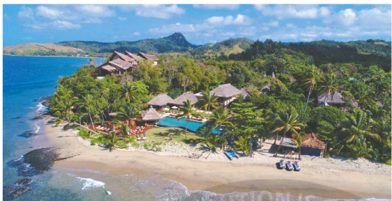
Nanuku is a five-star resort located on the southern coast of Viti Levu, Fiji's main island. NANUKU RESORT FIJI