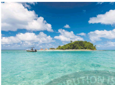
A boat trip takes Nanuku guests to a nearby island.