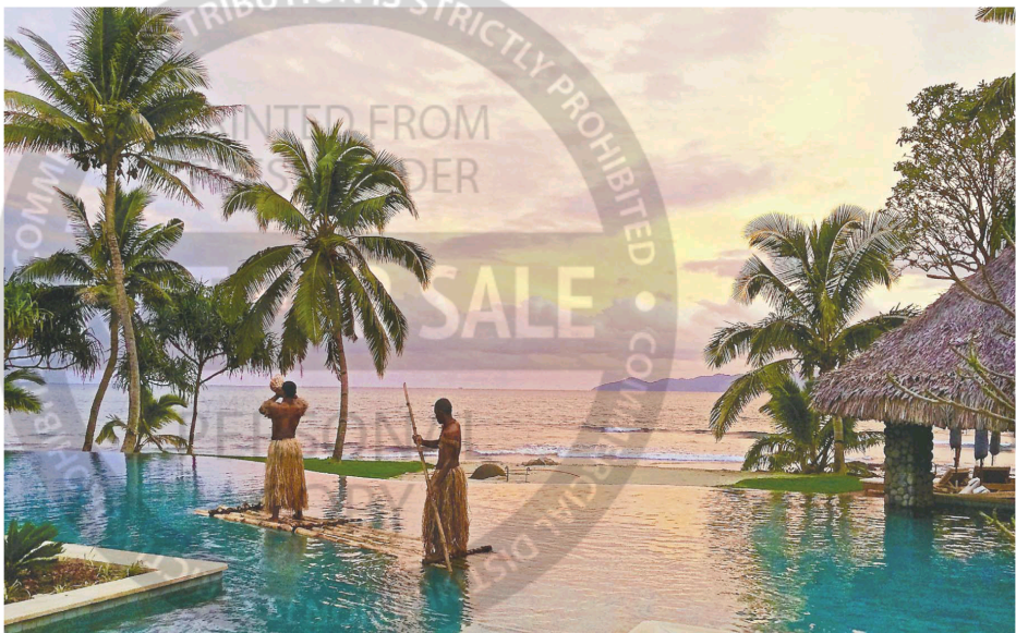
A torch lighting ceremony takes place at Nanuku Resort. Fiji is known for its stunning white beaches and lush tropical landscapes.