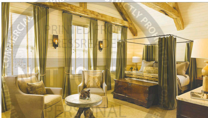
Eleven Experience's luxurious Scarp Ridge Lodge offers premium accommodation in Crested Butte.