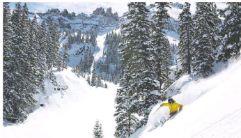
Telluride's legendary terrain is a joy to ski.

Instagram worthy Elk Street is lined with a watercolour painter's palette of Victorian-era wooden